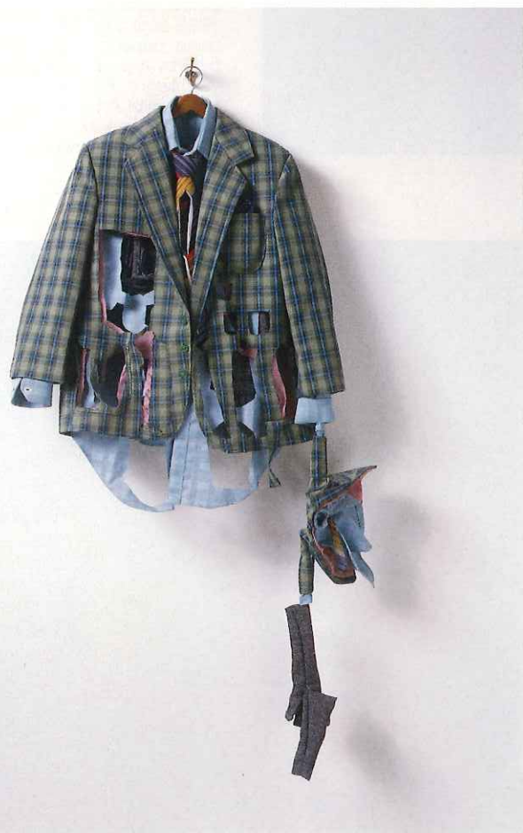
Above, Untitled (Suit with small suit cut from it) , 2000, fabric, thread and mixed mediums, 28½ by 12 by 3 inches. Collection Robin Wright and Ian Reeves.

ANOTHER SIGNIFICANT ISSUE in LeDray's work is labor. One could argue, of course, that labor-intensive craftsmanship is a hallmark of every sculpture in this show. But certain works seem to foreground this aspect more than others, including several tiny sculptures that are carved from human bone. Sturbridge Cobblers Bench (2000), for example, is just over 2 inches wide, yet this colonial-style worktable features mortise-and-tenon joinery, scalloped edges and even a functioning drawer. Miniature bone furniture is also displayed in an untitled work from 1999-2000 that comprises tables, chairs, armoires and bed frames that are precariously stacked to a height of 18 inches. These osseous objects link the art of fine cabinetry to LeDray's own fastidious practice, and ghoulishly remind viewers of the manual dexterity invested in both pursuits.