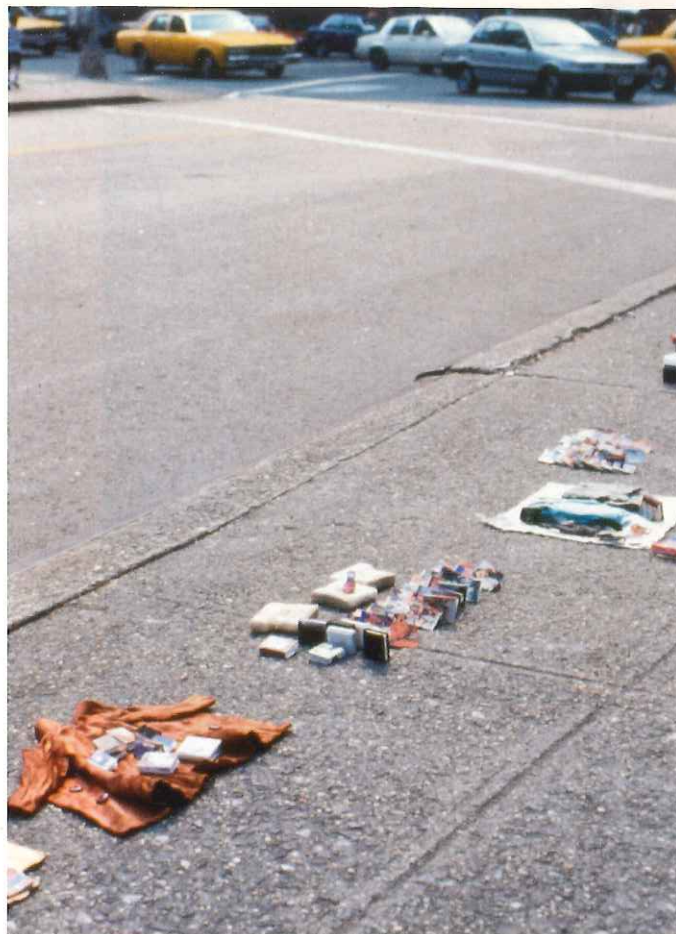
View of workworkworkworkwork , 1991, fabric, thread and mixed mediums, 588 objects, approx. 45 feet long; installed on a sidewalk, Astor Place, New York City. Private collection, Houston.

THAT THE STANDARD MEN'S SUIT is no less confining a uniform seems to be the message of numerous sculptures that subject this particular outfit to all manner of deformation and implied violence. In Hole (1998), for example, a diminutive wool jacket, striped shirt and paisley-patterned tie hang from a wall-mounted hook. But LeDray has cut a