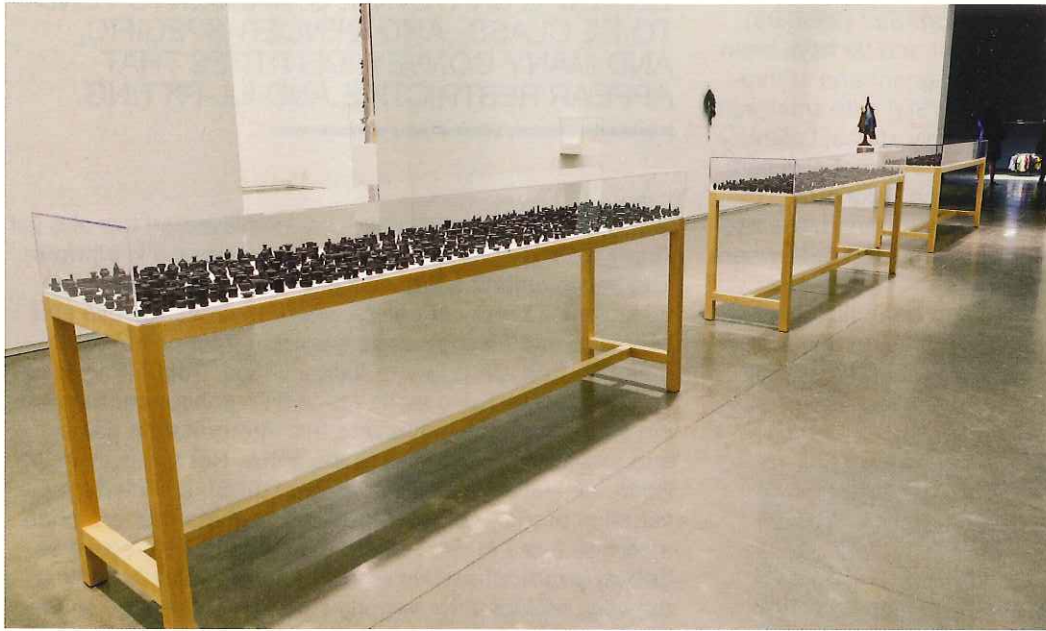
Left and right, overview and close-up of Throwing Shadows , 2008-10, black porcelain, dimensions variable.